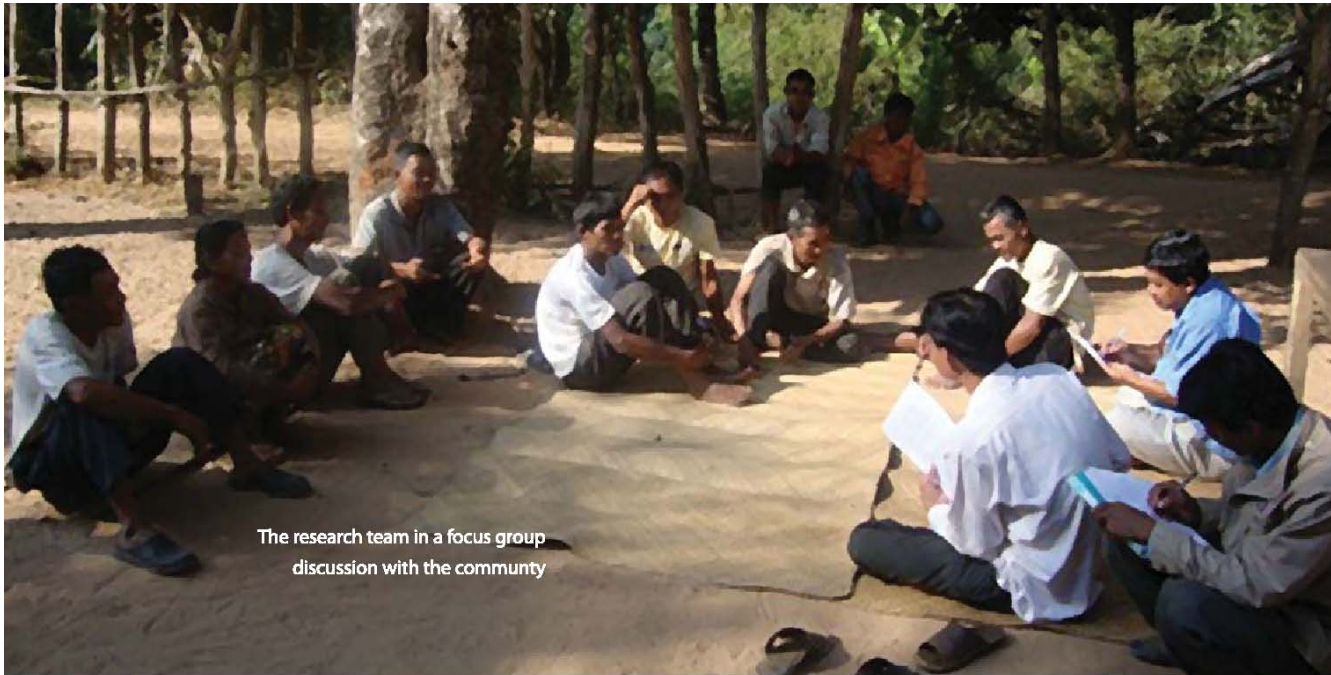
The research team in a focus group discussion with the community

Before finalizing the report, two series of workshops were conducted in order to validate the appropriateness of the research methods and the reliability of findings and recommendations of the study.