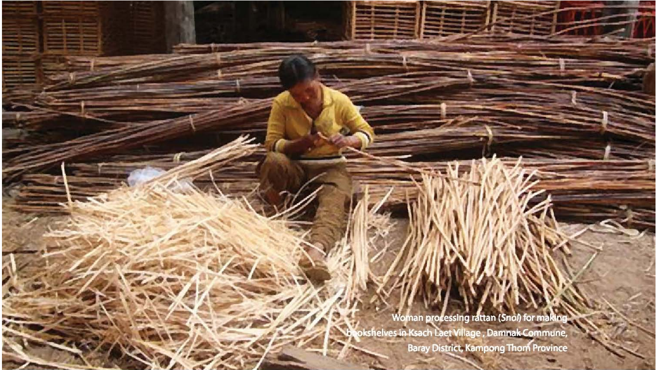
Woman processing rattan (Snol) for making bookshelves in Ksach Laet Village, Damnak Commune, Baray District, Kampong Thom Province

Thmai and Sroeng villages, but the CF has not been approved by the provincial cantonment 5 .