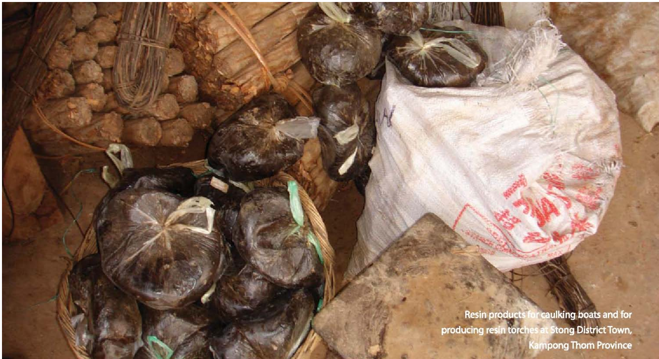
Resin products for caulking boats and for producing resin torches at Stong District Town, Kampong Thom Province

collectors of solid resin. Based on estimates, resin production through tapping in this area is estimated at 50 tonnes per annum. In practice, each resin tapper is able to collect 500 kg of resin per annum depending on the number of resin trees in the forest.