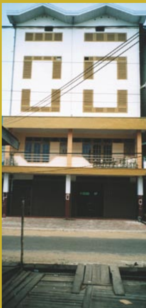
One of the swiftlet hotels in Ketapang Town