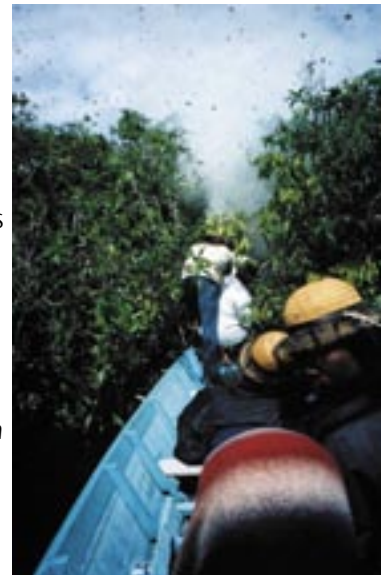
Honey hunting by boat in Danau Sentarum, Indonesia