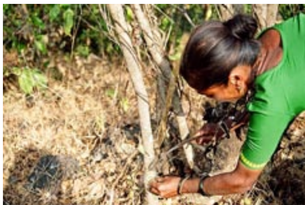
A demonstration of how Anogeissus gum is harvested