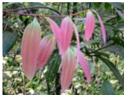
The tender sprouts of the leaves of the cinnamon tree

Unfortunately this ban existed only on paper and no auctions were held. But the leaves was removed illegally with the collaboration of lower level forestry staff. The material was moved with pass issued in Shimoga and regions where the extraction was permitted.