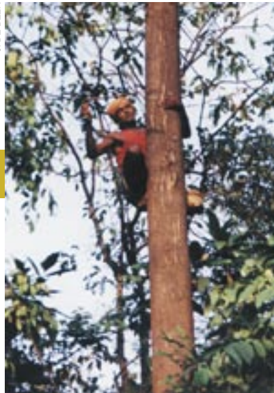
Resin tapping involves risking life and limb: demonstration by participant from Bastar