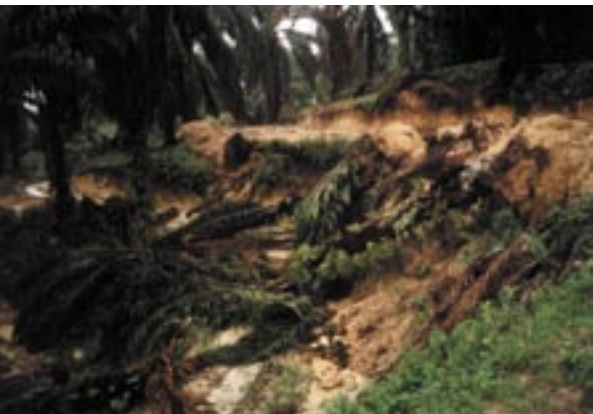
ABOVE: Erosion is one of the many environmental effects of oil palm plantations. RIGHT: A sign leading to an oil palm plantation in Malaysia.