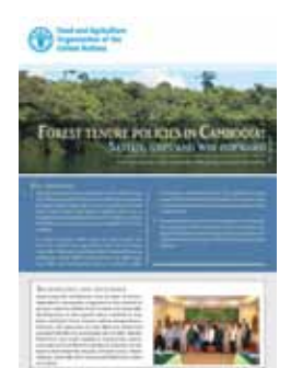
Forest Tenure Policies in Cambodia: Status, Gaps and Way Forward

Improving livelihoods and income of forest dependent communities is important in the context of poverty reduction efforts, food security, and achieving sustainable development goals (SDGs). In this regard, many countries in Asia have initiated forest tenure reform programmes. However, the outcome of such reform is mixed and potential benefits to rural people are not fully realised. Restrictive and weak regulatory frameworks, tenure insecurity, and insufficient institutional capacity are key factors limiting the impacts of forest tenure reform. FAO initiated a regional programme on Strengthening Forest Tenure for Sustaining Livelihoods and Generating Income in Cambodia, Nepal and Viet Nam in 2014. These three countries are referred to pilot countries.