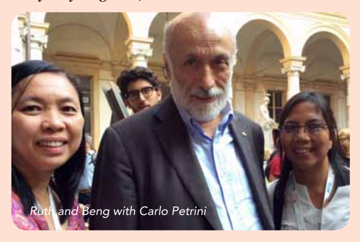
Voices from the forest Issue No. 31 November 2016

The event ended with a cheerful parade. It was momentous for all the Terra Madre network as they merge together with the City of Turin to "live an important experience of sharing." In his ending speech, Carlos Petrini, president of Slow Food, stated that as 500 million families around the world struggle on a daily basis to defend biodiversity, promote native seeds, and act locally to develop clean and health economies, the world of agriculture is dominated mainly by big multinationals. According to Petrini, in the face of all these huge multinationals, the Slow Food movement is an alternative model towards peeking into the future of food sovereignty and a progressively inter-connected food market – "they may be giants, but we are millions."