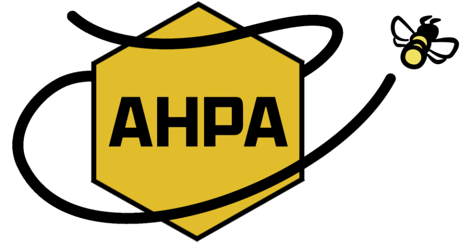
American Honey Producers Association

HOME ABOUT HONEY BEES & SUSTAINABILITY RECIPES LOCATOR